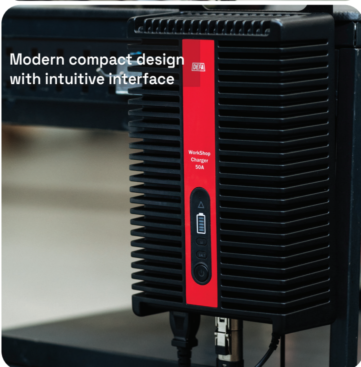
Modern compact design with intuitive interface

WorkshopCharger 40-50A Item Number 521-RAE-715800