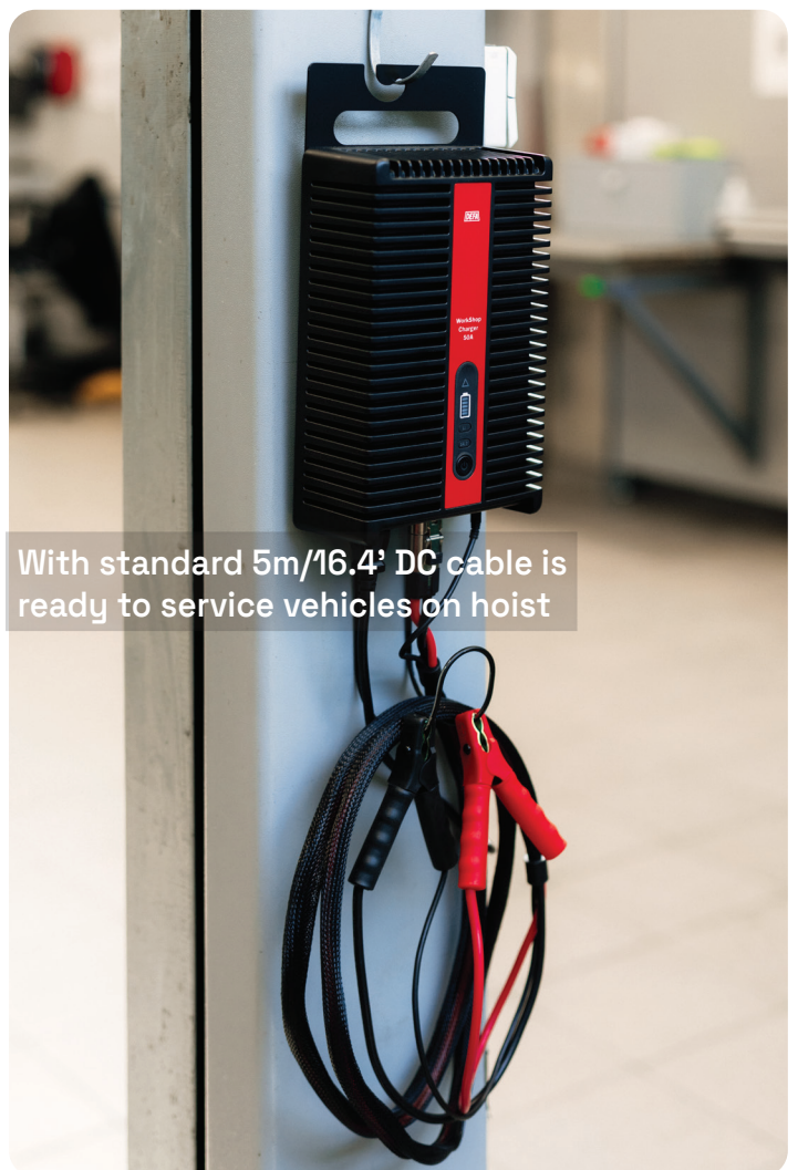
With standard 5m/16.4' DC cable is ready to service vehicles on hoist